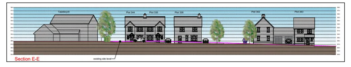
Figure 4 - Cross-section through Plot 334 and Tawelwch

Revised boundary edge cross section drawings have recently been submitted reflecting the changes in the site layout and confirming the finished site levels. The proposed relationship accords with the Council's Design Guide which should ensure that the amenities of the occupiers are protected. The cross-section is reproduced below for Members consideration: