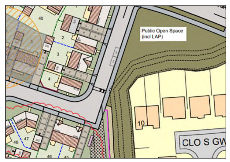
Figure 7 – Cross Section showing relationship between 10 Clos Gwaith Brics and Access Road

This is the relationship between a new section of estate road and the side/rear garden of the aforementioned property - see extract plan below: