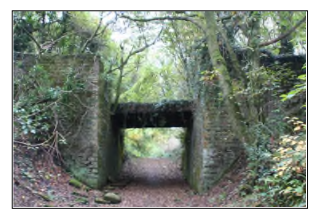
Figure 9 - The Grade II Listed Structures and Bridge

The draft Heritage Impact Assessment (HIA) identifies the following changes to the existing environment in the bridge's surroundings: