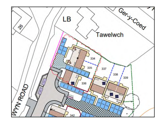
Figure 3 – Extract from Site Layout Plan

Revised boundary edge cross section drawings have recently been submitted reflecting the changes in the site layout and confirming the finished site levels. The proposed relationship accords with the Council's Design Guide which should ensure that the amenities of the occupiers are protected. The cross-section is reproduced below for Members consideration: