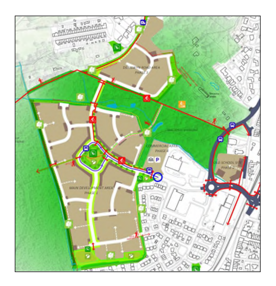
Figure 1 – Design Principles Framework

The Design Principles document approved in discharge of conditions 4 and 5 of the Outline Planning consent established the key placemaking principles for the development that have shaped the details contained as part of this Reserved Matters submission. Overall the site has been divided into four development phases.