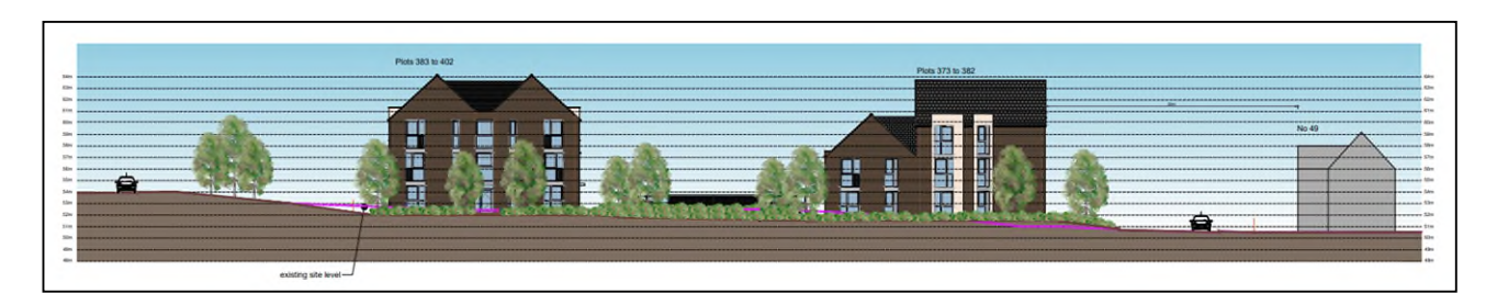
Figure 8 – Cross Section showing relationship between Plots 373-382 and 49 Maesteg Road

The Old School site which is Phase 2 of this development, lies opposite properties at the southern end of Maesteg Road. A three storey block of flats is proposed at the entrance to this phase directly west of 49 Maesteg Road and the relationship is detailed on the cross-section drawing below. As both the existing and proposed development front the highway, privacy standards will be achieved – a distance of 22m is indicated on the submitted plans.