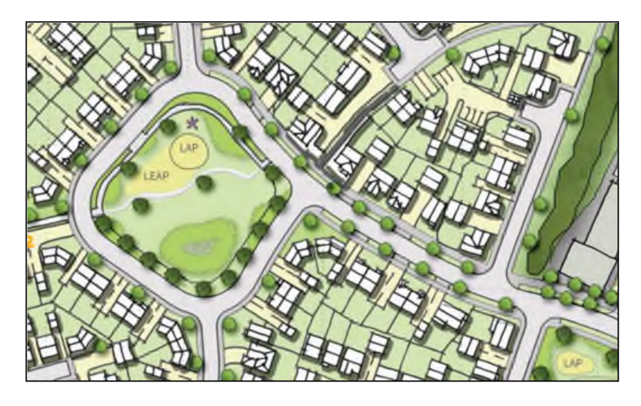
Figure 2 - Main Boulevard and Park Square

The layout of the MDA is formal in character with regular built form providing visual emphasis and continuity along this primary street. Park Square, a central neighbourhood green will form the main 'civic space' for the development connecting to key recreational walking and cycling routes and fronted on all sides by development. It is located off the primary access road for the development and will provide the main circulatory route for buses.